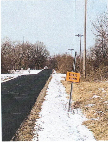
Pettis County, 32 nd street intersection