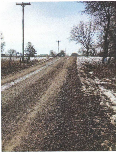
Pettis County, Baker Road