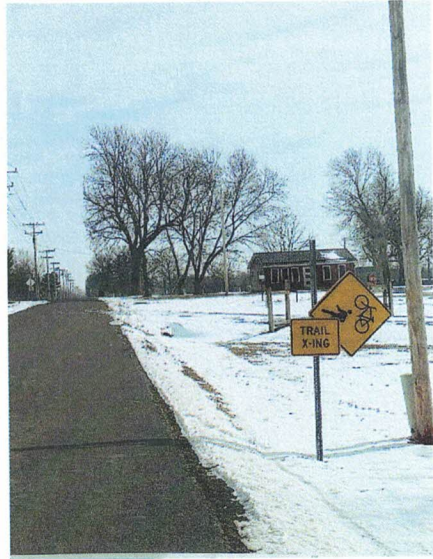
Pettis County, Sacajawea intersection